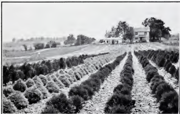
Ret. Squarrosa Veitchi and Thuja Occ. Pumila, 1 to 1½ ft.